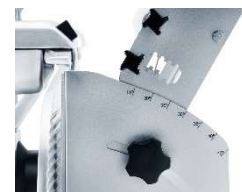
Carriage inclination adjustable for different slice sizes